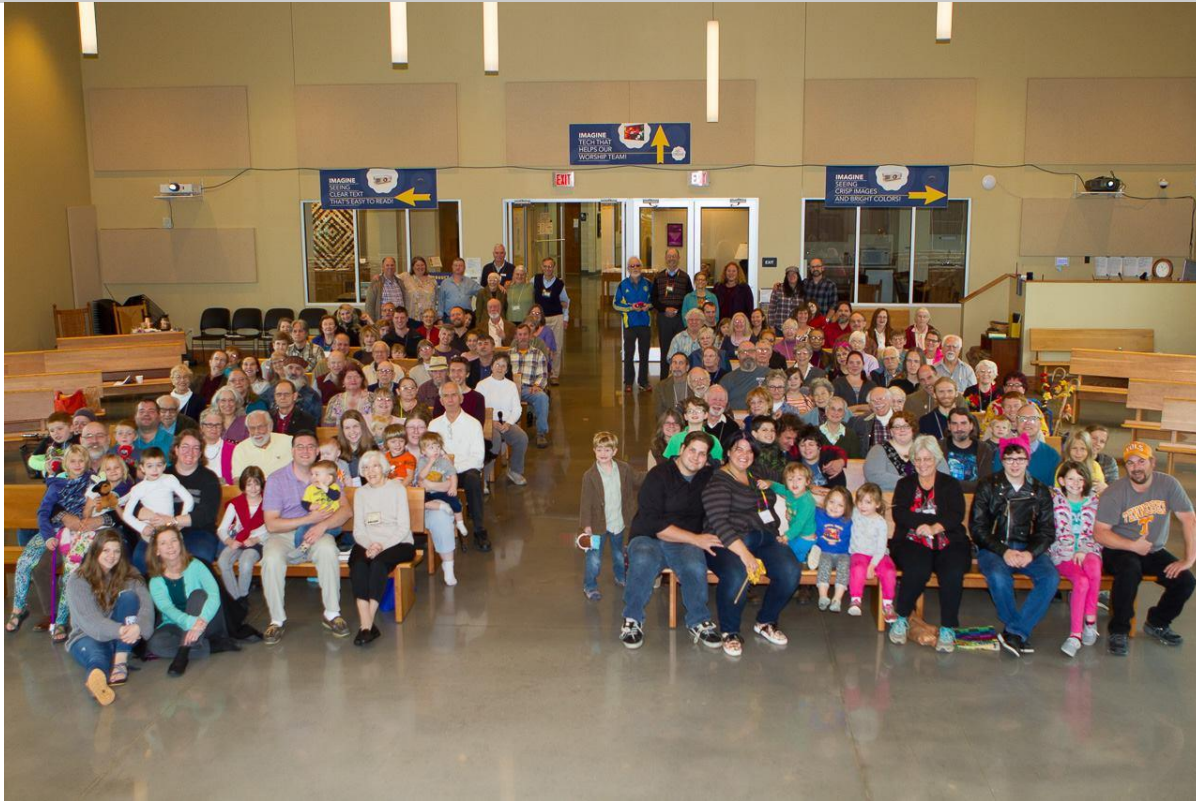
2017 Congregation Photo