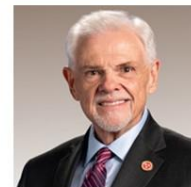
Senator Ken Yager, District 12