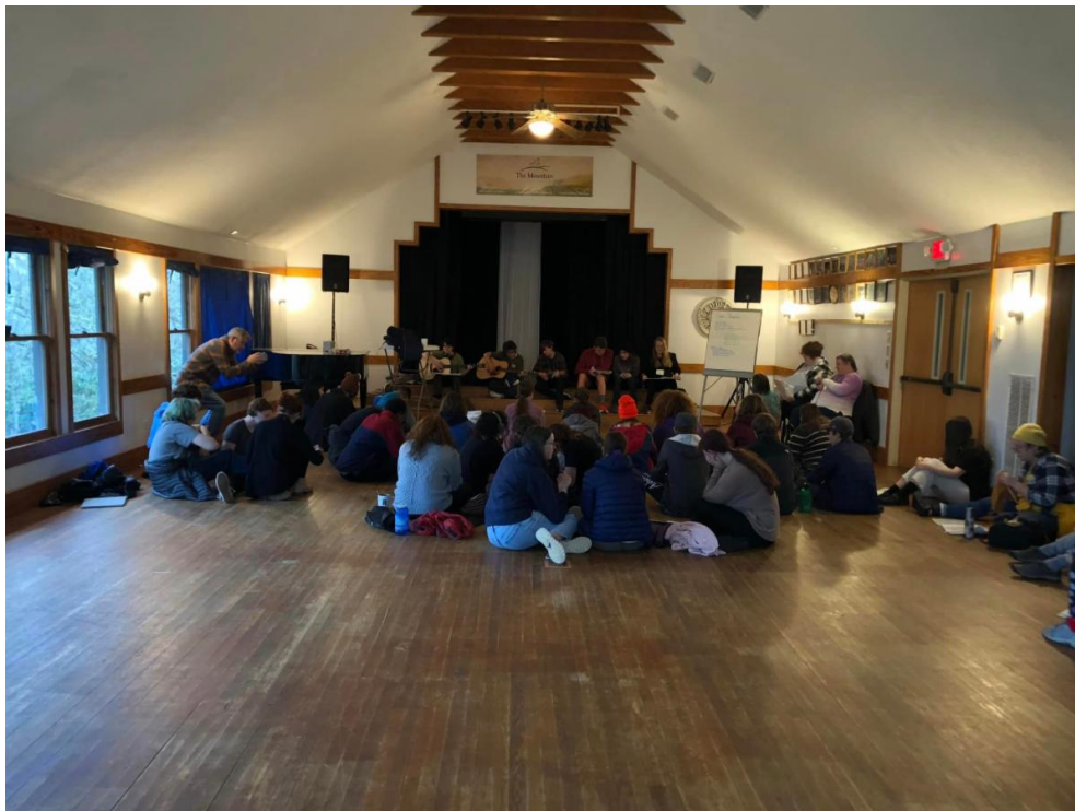
Photo of High School Mountain CON, December 2023