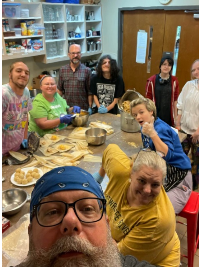
The Tamale Making Crew, Sunday, Nov. 19.

Tamales may be picked up on Sunday, Dec. 10, 17 and 24 after worship, or from the church office beginning Monday, Dec. 11.