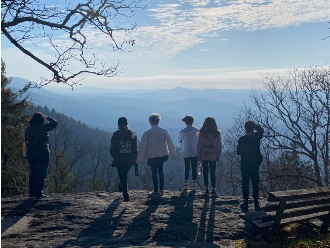
ORUUC Middle School Youth at MountainCON, March 2022

CONs are back at the Mountain! REGISTER for Fall CON TODAY: https://www.themountainrlc.org/cons .