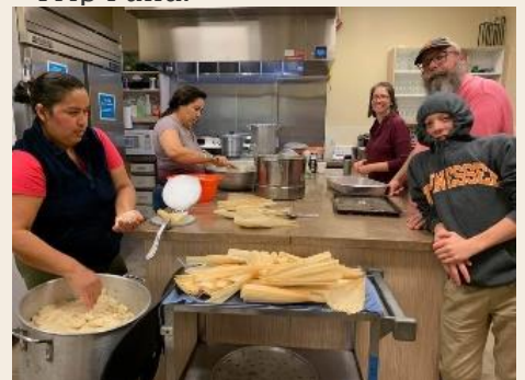
Tamale Making 2019

Thanks to a generous gift from the Endowment Committee this year, we're able to purchase our tamale making supplies so that all of the proceeds from our sales will go into the Youth Trip Fund.