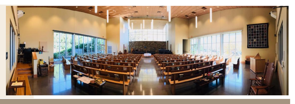
News from Oak Ridge Unitarian Universalist Church

This Sunday (pg.2) Announcements (pgs.3-4) Family News (pg.7) Ministerial Search Update (pg.9) Covid Update (pg.10) Church Calendar (pg.11)