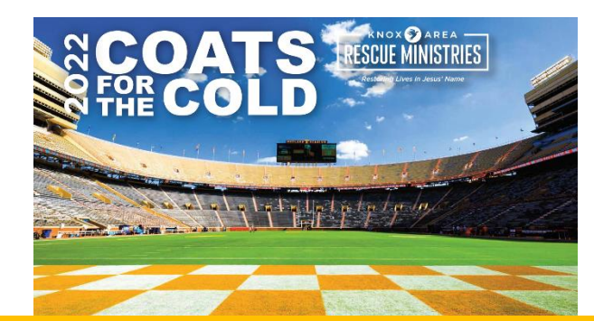
ORUUC has KARM coat vouchers! Pick one up in the church office TODAY! Coat vouchers expire TOMORROW, Dec. 10!

Looking for a fun way to give back this month? Try this Reverse Advent Calendar! Once you've collected all of the nonperishable food items listed, drop them off at church for the pantry. You'll make a difference!