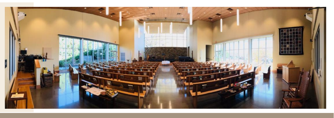
News from Oak Ridge Unitarian Universalist Church

This Sunday (pg.2) Holiday Calendar (pg.3) Covid Update (pg.10) Church Calendar (pg. 11)