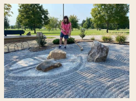
Photo courtesy The Oak Ridge International Friendship Bell Facebook page

https://www.facebook.com/ORfriendshi pbell