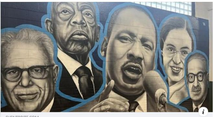
Rescheduled 2024 MLK Prayer Breakfast