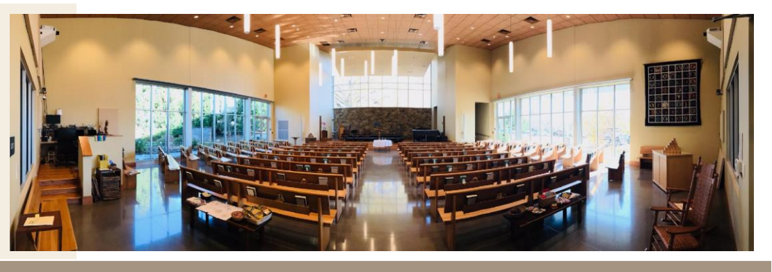
News from Oak Ridge Unitarian Universalist Church

This Sunday (pg.2) Rummage News (pg. 5) Family News (pg. 6) Covid Update (pg.7) Ministerial Search News (pg. 8) Church Calendar (pg. 9)