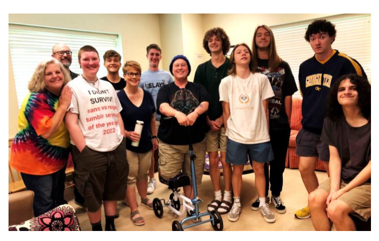
The High School Group on a Sunday morning this Spring during Faith Formation Hour.

What's a favorite ORUUC memory that you have? One of my favorite memories from ORUUC was the Boston Trip. It was an amazing bonding experience and I enjoyed finding out about other UU churches.