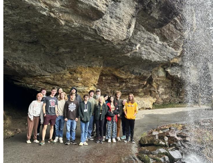
Senior CON at the Mountain, December 2022