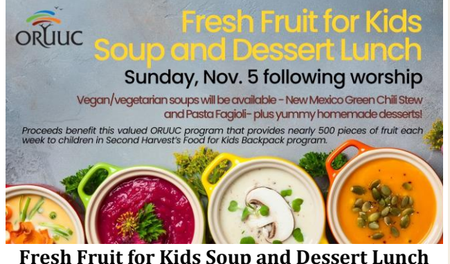
Fresh Fruit for Kids Soup and Dessert Lunch is Back!

Covid-19 Update: Masks are <u>not</u> required in the building; we have masks and hand sanitizer available, and we encourage you to do what makes you feel comfortable.