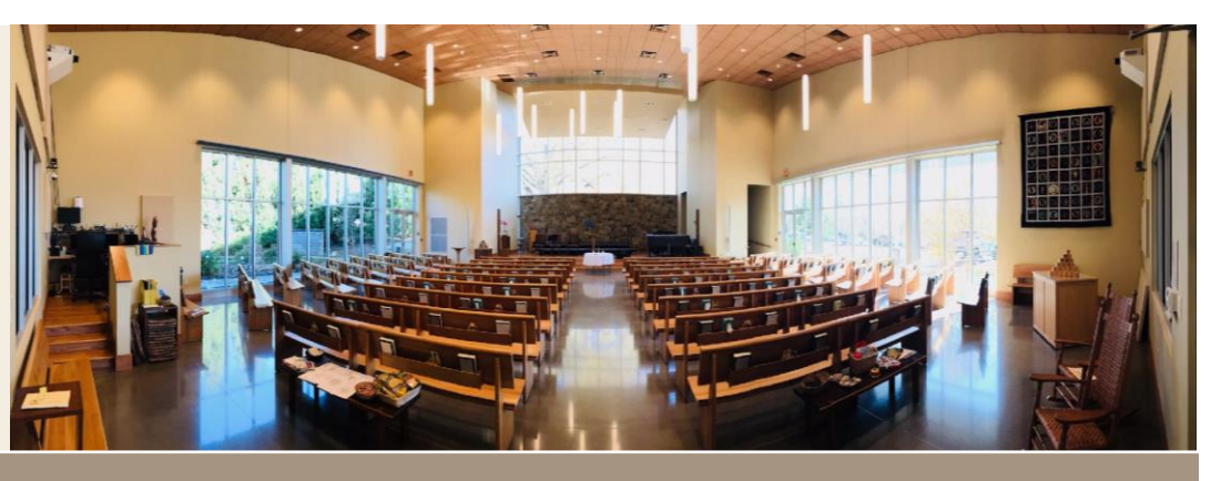
News from Oak Ridge Unitarian Universalist Church

This Sunday (pg.2) Announcements (pgs.3-4) Social and Volunteer Activities (pg.6) Family News (pg.7) November Worship Schedule (pg.8) Community News (pg.9) Church Calendar (pg.10)