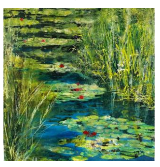
Mixed Media, Acrylic, 8" x 8"