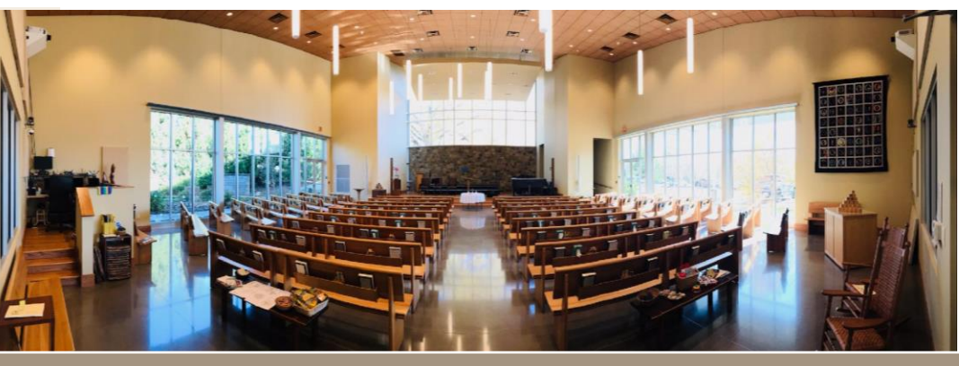
News from Oak Ridge Unitarian Universalist Church

This Sunday (pg.2) Announcements (pgs.3-4) Caring News (pg.5) Social and Volunteer Activities (pg.6) Family News (pg.7) Community News (pg.9)